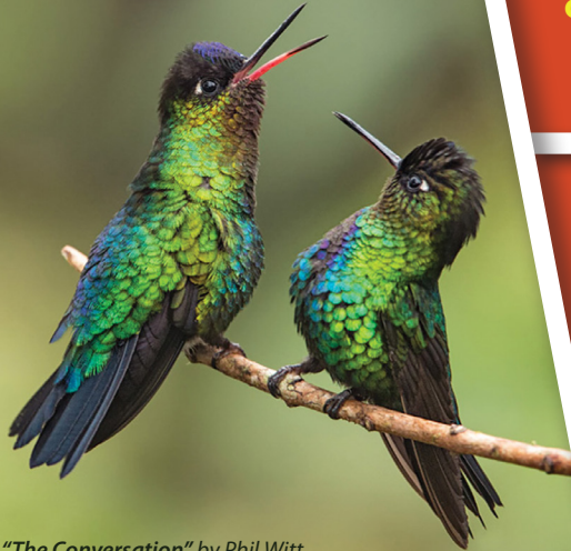
"The Conversation"